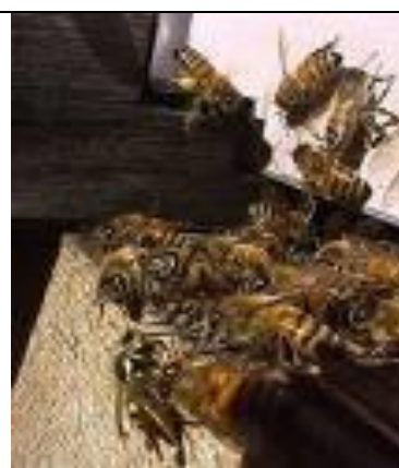
wasps will try and enter a hive

You can buy wasp traps from suppliers or you can save a few pounds and make one yourself from a clear 2 litre plastic bottle, as shown in the photographs below. – it will work just as well.