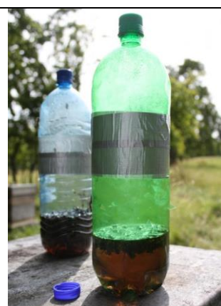
clear bottles worked best