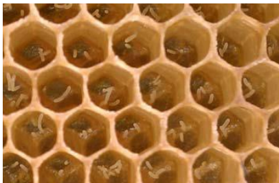
Multiple eggs from laying workers

Your chosen swarm control technique should continue until mid July by which time the swarming season should be over and provided you have enough supers on the hive you can go on holiday for a week or two. If you previously left a sealed queen cell in a hive as part of your swarm control, you need to check that she has managed to mate and is laying well. If she has been slow to mate due to bad weather she could become a drone laying queen (DLQ), i.e. capable only of laying unfertilized eggs and she will need replacing. If you find more than one egg in each cell, the young queen has either just starting laying or there are laying workers (LWs) in the hive but how can you tell the difference? Well, with laying workers, you will find that the eggs have been laid on the cell walls as the worker's abdomen is too short to reach the bottom of the cell.