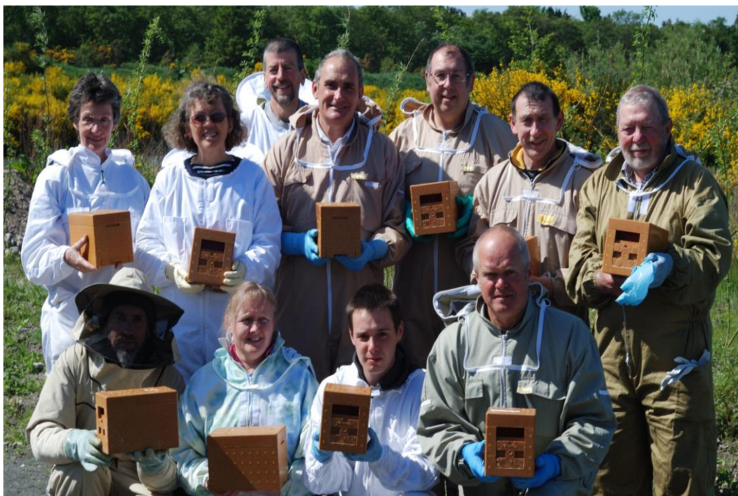
Group members with their stocked mini nucs

Moray Beekeepers Association (MBA) Training apiary at Birnie has been a hub of activity this season with beekeepers visiting from all over Scotland and Europe (see June's Auricle for details of the Swedish visit).