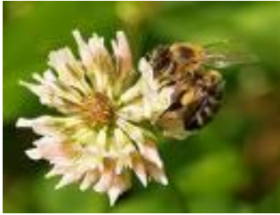
honeybee on clover

July is a month of bounty and given half decent weather, honeybees will be hard at work, foraging on white clover, bramble, lime, charlock, bell heather and rosebay willow herb. It is now that all your efforts in managing your colonies and preventing swarming will reap a harvest and the strongest colonies will fill one, two or maybe three supers with honey.