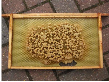
tidy compact brood nest of a drone laying queen

workers' ovaries to develop until they start laying the unfertilized eggs that will only produce drones