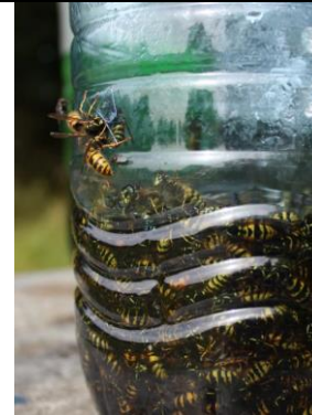
it definitely works!

Cut about 5 holes in the bottle, about 1/3 of the way up and above that, about 2/3 of the way up, wrap a couple of bands of duck tape. Pour in the magic mix, then screw the top back on and sit on the ground beside the hive or just park it on the roof. The small holes were originally supposed to be the diameter of a thick straw and round, but two quick cuts with a Stanley knife blade and folded back to expose a small triangular hole is equally effective. If it is windy you can secure the bottle by trapping between a couple of boulders or attaching it somehow to the side of the hive.