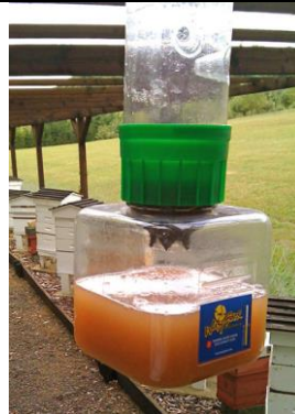
commercial wasp trap