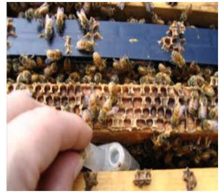
Cage is fixed onto the top of a brood frame

Being very careful, introduce the queen into a Butler cage, one end being plugged permanently and then cover the other end with newspaper and an elastic band. If she manages to fly off at this stage she will fly towards the bathroom or car window but won't be able to escape and you will easily be able to catch her. Be careful if handling a queen and only hold her by the wings or thorax not her abdomen but better still, try and coax her into the cage without touching her.