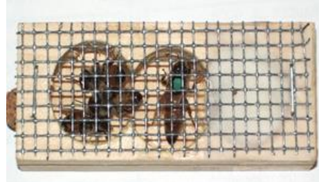
Queen in travelling cage with attendants

Make up a 3 frame nucleus, ideally of young house bees, from the colony to be re-queened and place next to it but facing the other way, so it is ready to receive the new queen. If you want to make sure the nuc is hopelessly queenless, i.e. the bees are unable to raise a new queen, you should make up the nuc and seven days later go into it and remove any queen cells the bees have made. It is a good idea to feed sugar syrup, 2lb of sugar to 1 pint of water, as there will be few flying bees in the nuc.