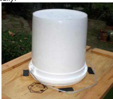
Contact feeder, 1 kg of sugar to 1 pint of water

If you have bees and they have been fortunate to come through winter, and you have successfully treated them for varroa, and escaped the attention of the woodpeckers, it would be a shame to lose your bees in spring wouldn't it? But, as experienced beekeepers know, this is a critical time for your bees and they can easily starve to death. This is because, between February and April, when the Queen has resumed laying, and the amount of brood is greater than the adult bees for a while, a cold spell will prevent the bees foraging and they can quickly run out of stores and be unable to feed the growing larvae. So keep a close eye on them and feed a thin syrup if necessary, 1kg of sugar to 1 pint of water. Use a contact feeder and once you start feeding syrup, keep going until the spring nectar flow starts or the weather improves. If it is very cold, and stores are low, place a block of fondant directly onto the top bars of the hive or over the crown board feed hole, as in the cold the bees don't take syrup down very readily.