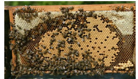
A good frame of brood & stores

It is also a good idea to change 3 or 4 brood frames every spring with frames of wax foundation as this prevents build up of disease pathogens in the comb and gives the bees something to do preventing early congestion which can lead to swarming. Choose frames that are brood free, clogged with pollen, have too great a percentage of drone brood or have holes in the comb and move them to the outside of the box. You can make the change there and then if stores are adequate or do it at the next inspection.