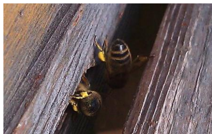
Pollen going into the hive – a good sign!

In March, when the bees are flying and bringing in pollen you can change the floorboard, remove the mouseguard and if you have an open mesh floor it is a good idea to replace the floor insert as this will mean extra warmth, useful in helping the bees to incubate the brood at a time when it can still be really cold at night.