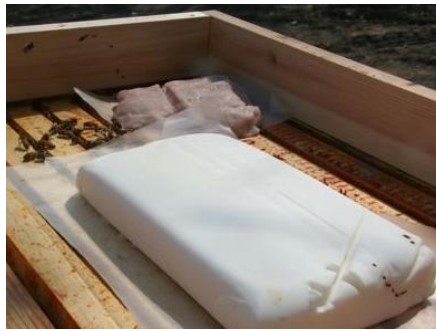
If very cold add a block of fondant

regularly during the summer too as you will then have an idea of what a hive with plenty of stores feels like and you can use this as a comparison in winter.