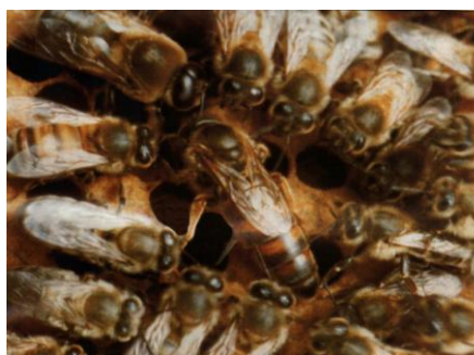
Laying queen surrounded by her retinue

In April, on a warm still day (over 14C) you can carry out the first inspection of your brood chamber. You need to check for stores and check that a Queen is present and laying. How do you do that? Well, if you see a Queen you know she is there and if you see single eggs in the base of cells it is a sure sign that the Queen is laying and brood of all stages will re-inforce that view.