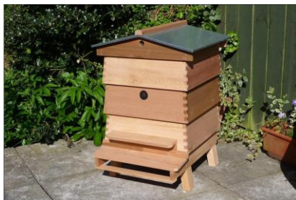
The new hive arrived

The hive arrived a few days later, construction and site positioning followed, and then all we had to do was