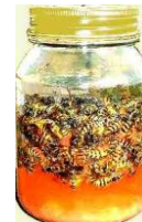
Wasp traps didn't seem to work!

The other factor I battled was wasp attacks. I'm not sure if they were after the sugar-syrup I was feeding the bees, or after any honey that had been deposited in the brood nest, but it was clearly the start of the demise (I know with hindsight). I struggled to keep wasps out of the hive, and clearly they were less interested in the jam and marmalade traps I laid that the honey harvest inside the hive.