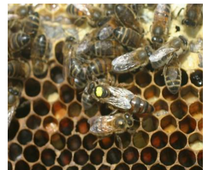
A marked queen is easier to find

Many beekeeping management techniques involve finding the Queen so if she is marked it will really help you. (Editor's note: come to the April meeting at Birnie if you want to learn how to mark and clip Queens!).