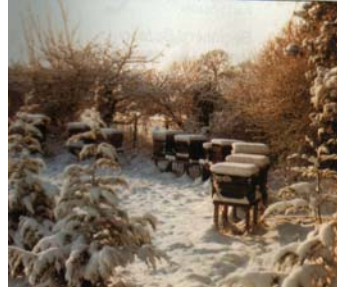
wind protection is important