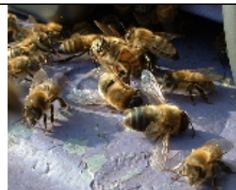
Drones being evicted from the hive by worker bees

The Drone bee is large, but rounder and slightly shorter than the queen and has no sting. His head is large and almost spherical, mainly composed of the two large compound eyes that are on top of his head. He has long legs and very large wings that completely cover his abdomen, which is stumpy and almost square at the rear. Beginners can easily confuse a drone for the Queen when looking in a hive but once the Queen has been spotted she is beyond comparison.