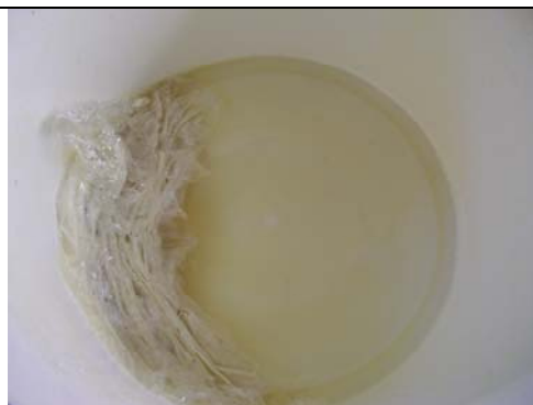
The scum ends up stuck to the cling film

Continue decanting as normal. As the level goes down the film should stay anchored to the side where it has been stuck and the film on the surface should now be pulled across the top, dragging the scum with it. Even if you don't get it exactly right (like my effort in the right hand photo) you will still get clear honey right to the last jar. And as the saying goes, 'Practice makes perfect', so give it a go and let us know how you get on.