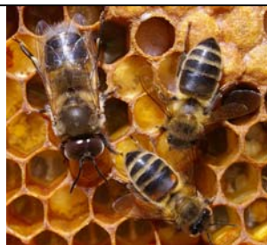
A larger drone on the left in comparison with the 2 worker bees

'The useless drones' 'Big gangly drones!' 'Daft looking things' 'Why do the bees bother with the drones anyway? Just some of the comments I heard at the latest MBA meeting, made in jest I know, but it does seem that not everyone appreciates the drone and their contribution to a honeybee colony. So let's have a closer look at the male honeybee, the drone.