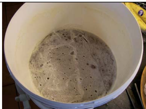
Lay the cling film on top of the surface scum

Cut a length of cling film about the same diameter as your bucket plus an extra 6-8 inches. Starting at the gate side of the bucket lay the cling film on the surface of the honey scum but don't allow any film to stick to the inside of the bucket yet. If your bucket diameter is greater than the width of the cling film you may have to use 2 lengths of film side by side. Try to lay it so as to trap as little air as possible and then when done stick the extra 6-8 inches of film to the inside of the bucket.