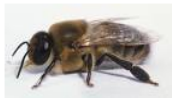
Notice the very large compound eyes covering almost the entire face and top of the head