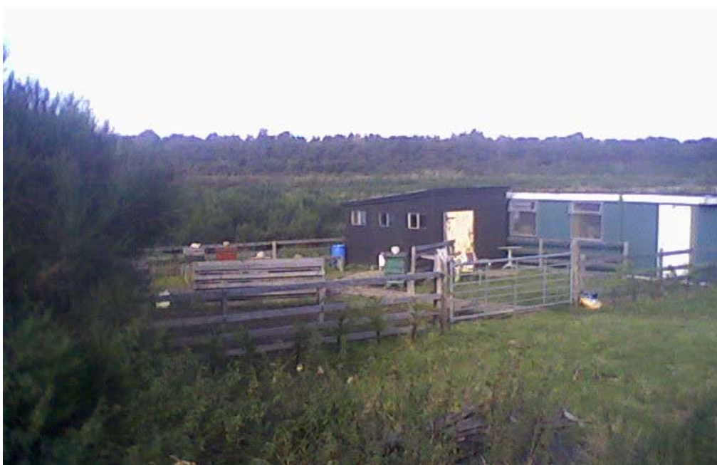
Birnie apiary site looking good!

September's working party meeting went exceptionally well with 30 members turning up to clean up and carry out repairs to the apiary, storage hut and the portacabin. Weeds and grass were strimmed down and raked up, and an area was rotavated and de-stoned before being planted with bulbs and sown with flower seeds.