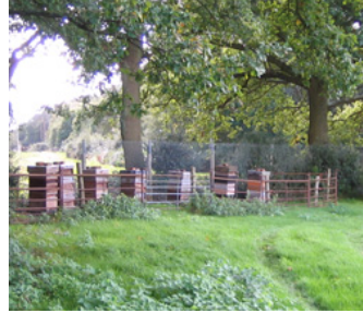
a good stock fence