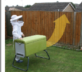
raising the flight path

The main criteria in locating your bees is that the flight path should not cross footpaths or other areas where there is likely to be human or animal activity. The reason is obvious, as you don't want your bees stinging the neighbours or the neighbours' dog or horse. If you have no option but to keep the hive in your garden, and you do have close neighbours, you can face the hive entrance a few feet from a high fence or wall. If this is say 6 or 7 feet high the bees will have to fly to that height when they leave the hive and will then be flying above the heads of passers-by. But you will have to take into account that your bees may end up drinking at neighbouring bird baths or garden ponds, they may swarm into your neighbour's garden and they may soil the neighbours' washing as they make their cleansing flights in winter and early spring! So think carefully if you live in a small suburban garden with close neighbours, whether it's worth keeping your bees at home and falling out with the family next door.