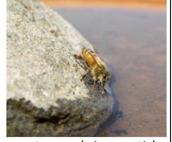
water supply is essential

Ideally there will be plenty of space around each hive (if you have more than one) for colony manipulation and maintaining the site, e.g. grass cutting. Also, leaving a 2 metre space around the hive will give you room for future expansion. Placing the hive on some sort of hive stand is also advisable, say 18 -24 inches high as this will prevent backache when opening it, and will provide ventilation around the hive, which is beneficial to the bees.